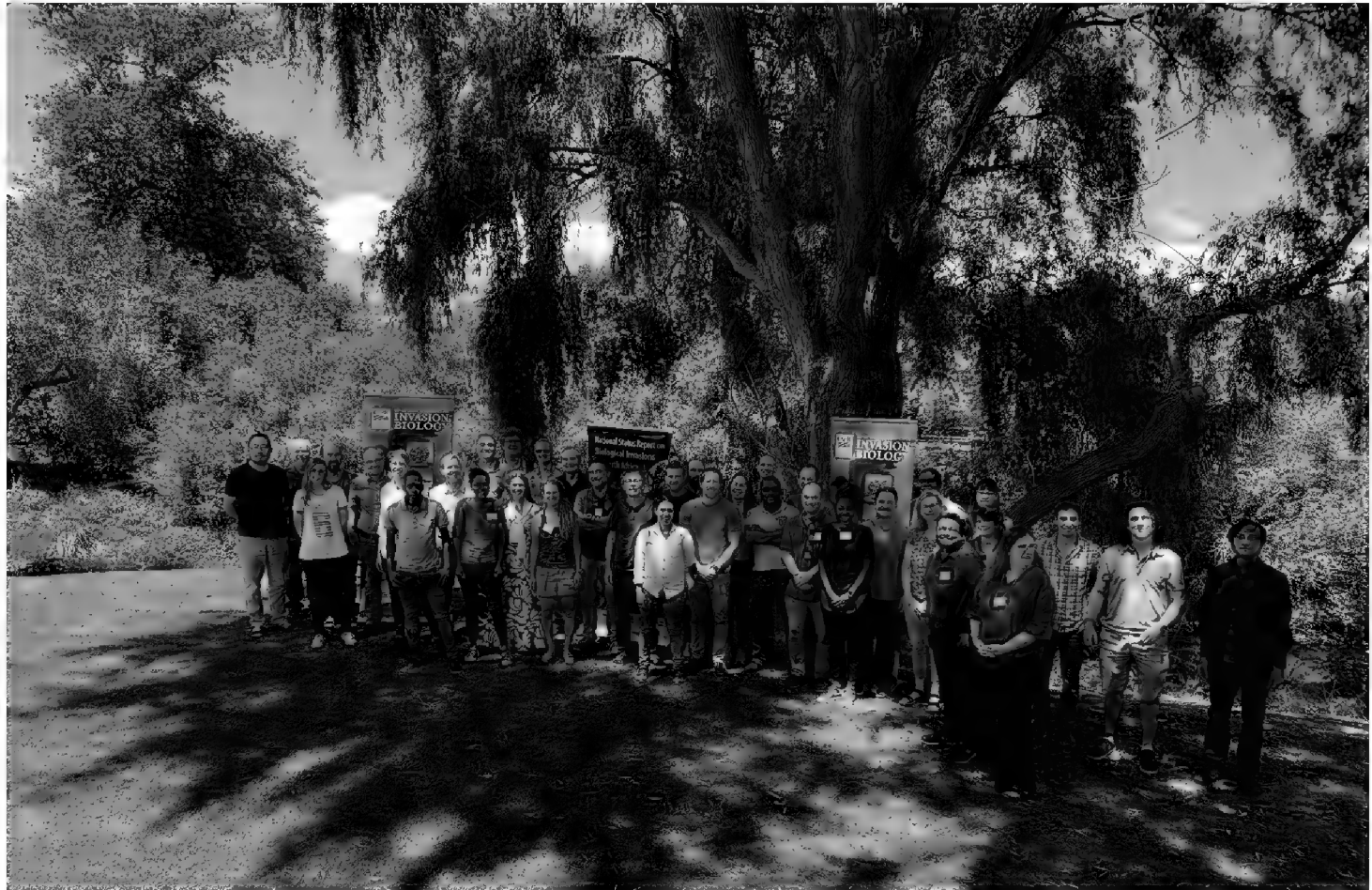
Figure 3. Workshop attendees benefitting from the shade of an alien Eucalyptus sp. on a transformed lawn.